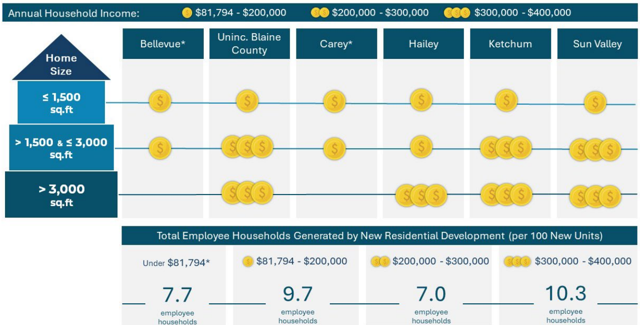
Table 16 Expected Household Income for New Residential Development

Lastly, the area median income of $81,794 is based on 2022 Census data and, like other data sources used in this study, will change from year to year. To adapt the study results to future years, it is important to note that the general relationship between the income categories and the employee households is expected to remain the same. Barring any significant shifts to the local economy (e.g., recession), these income categories can be used to estimate employee household generation and anticipated future housing needs.